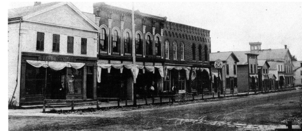
East side of Main Street from the North prior to 1894 fire.