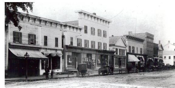
West side of Main Street from the south prior to 1894 fire.

Founded in 1833, Almont is the sixth oldest village in the State of Michigan. Originally called Newburg, the Village was incorporated in 1855 under their new name of Almont. The historic roots of this charming community create the foundation for a unique downtown. While numerous fires have devastated the landscape of the downtown throughout the late 19 th and early 20 th centuries – Almont has been able to preserve and maintain much of the architecture that has created the character of the community. Enjoy your visit and the stories that our downtown has to tell.